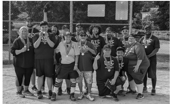
Gateways Gators Unified Softball Gold Medalists